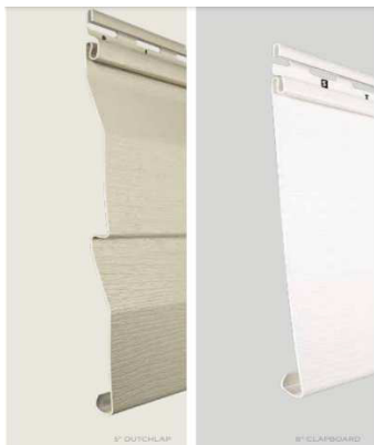
Dutchlap or Clapboard

Material : Double pan 5" Vinyl or aluminum may be used in Painter's Hill