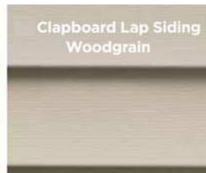
or “Natural Woodgrain”